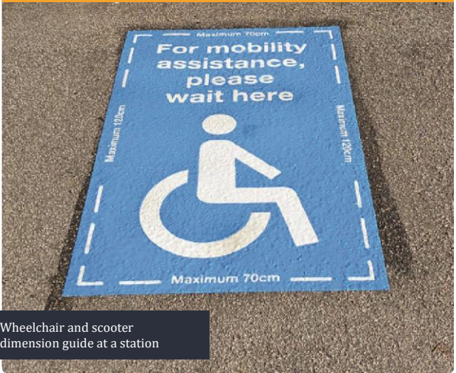
Wheelchair and scooter dimension guide at a station

We offer a Video Relay Service in partnership with Convo to support deaf and hard of hearing customers whose first or preferred language is British Sign Language (BSL). This free service allows customers to video call a BSL interpreter who will relay the conversation with our team. For more information, visit: www.chilternrailways.co.uk/before-you-travel/Assisted-Travel-Information