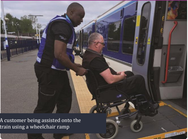
A customer being assisted onto the train using a wheelchair ramp