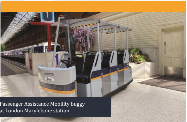
Passenger Assistance Mobility buggy at London Marylebone station

If your wheelchair or mobility scooter exceeds the above dimensions, we will unfortunately be unable to accommodate you on our services.