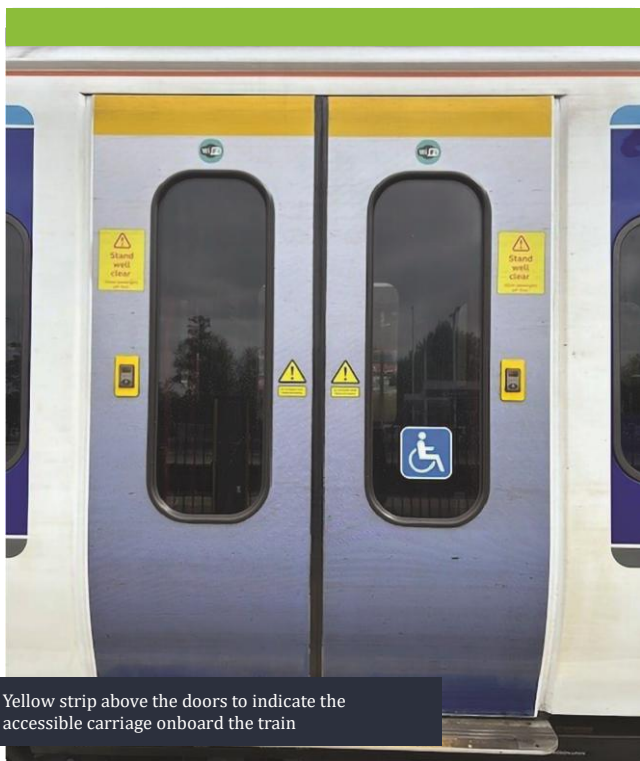
Yellow strip above the doors to indicate the accessible carriage onboard the train